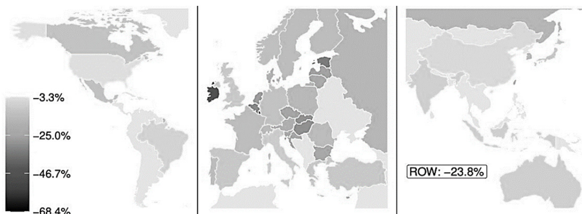
Fig. 2. Impact of supply chain disruptions on the economies well-being [20]

To confirm, a special example is considered – the COVID-19 pandemic in China. The disruption of supply chains led to a significant decline in welfare in 2020 (Fig. 2) in highly integrated EU countries (Luxembourg (–67,6 %), Malta (–54,1 %), Ireland (–47,3 %), etc.) and countries with high dependence on international trade (Taiwan (–21,3 %), Russia (–15,8 %), etc.). Countries with more closed economies for trade and a small number of intermediate links in production flows suffered less (USA, China, Brazil within –6,2 %).